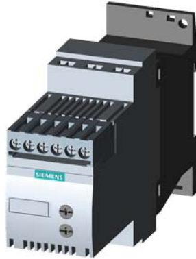
SIRIUS soft starter S00 6.5 A, 3 kW/400 V, 40 °C 200-480 V AC, 110-230 V AC/DC Screw terminals