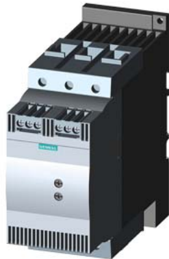
SIRIUS soft starter S3 80 A, 45 kW/400 V, 40 °C 200-480 V AC, 110-230 V AC/DC Screw terminals