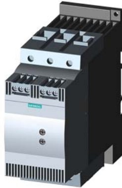
SIRIUS soft starter S3 106 A, 55 kW/400 V, 40 °C 200-480 V AC, 110-230 V AC/DC Screw terminals